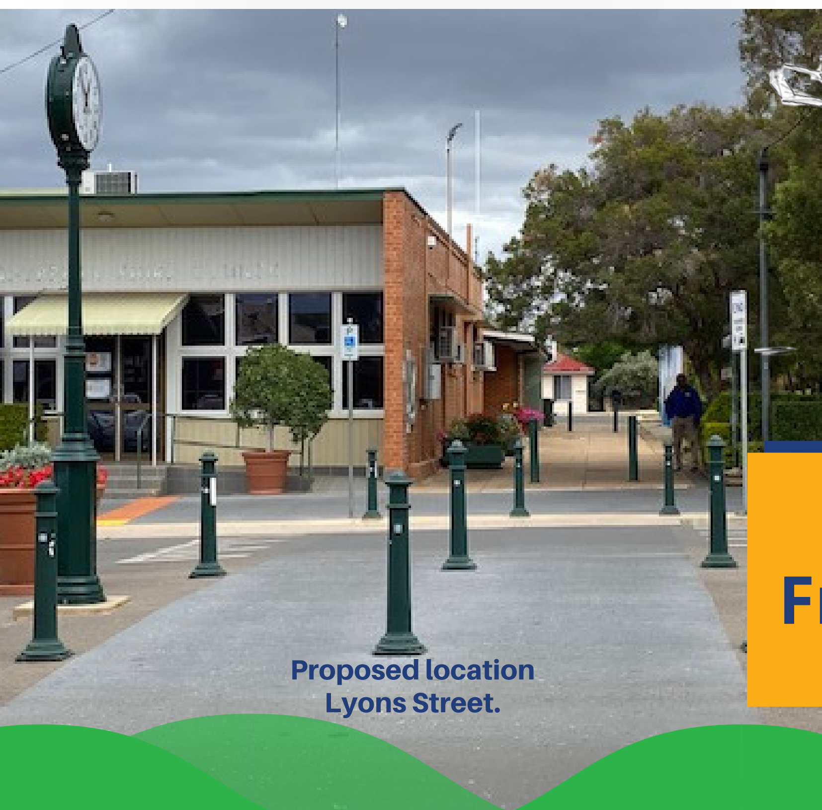
Proposed location Lyons Street.

For more project details, please visit www.northburnett.qld.gov.au/news