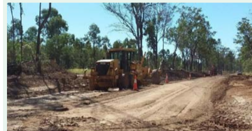
Greentree Rd (Betterment works), Mundubbera 'under construction'.

Mundubbera - Barbours Rd, Greentree Rd, Hawkwood Rd, New Cardarga Rd