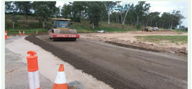
Yenda Benyenda Rd, Gayndah 'under construction'.

Mundubbera - Green Tree Rd, Taylor's Rd, Deem's Rd