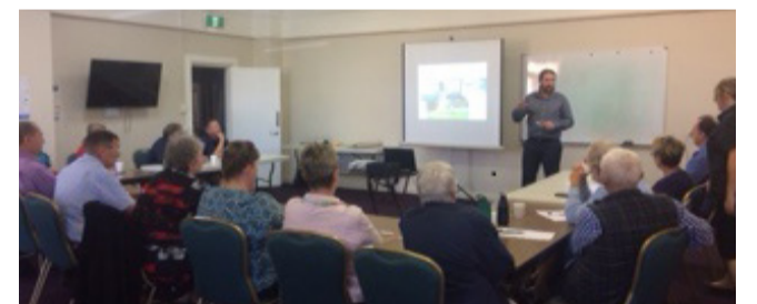
Economic Development and Innovation Strategy Consultation Session in Monto on 17 April 2018.

For further information or assistance accessing or completing surveys please contact Council's Economic Development Team on 1300 696 272 (1300 MY NBRC) or via email admin@northburnett.qld.gov.au .