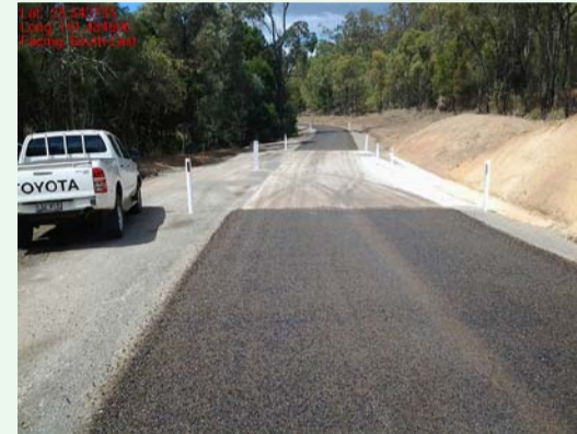
Section of Redvale Road, Gayndah 'completed'

Council acknowledges the Natural Disaster Relief and Recovery Arrangements (NDRRA) funding is a joint Commonwealth and State Government program.