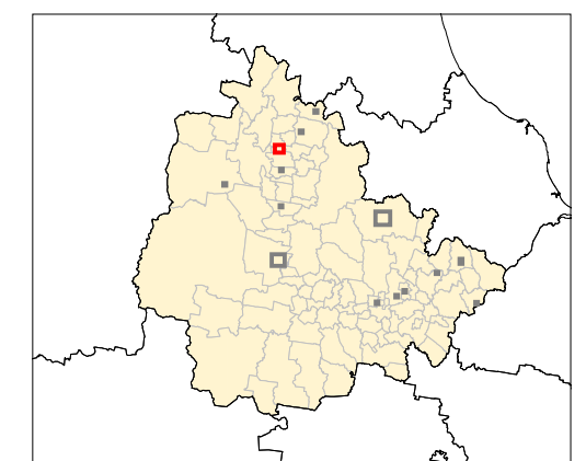
Overlay Map OM-HL-01